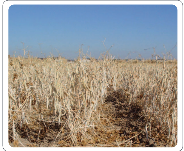
Black 06252 VS T-39*

Assuming a 160 lbs./AC yield advantage compared to T-39, profit would increase $51.20/AC on $32/cwt. beans minus the difference in seed cost/acre. This amounts to about $7,872 increased profit over T-39 on a one quarter section field.