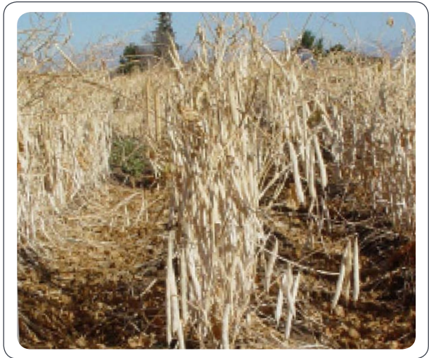
NA 01054 VS. NORSTAR

Assuming a 330 lbs./AC yield increase over Norstar, this variety can potentially increase your profit $52/AC on $16cwt. beans, minus the difference in seed cost/AC. This can calculate out to an approximate $7,200 increased profit over Norstar on one quarter section field.