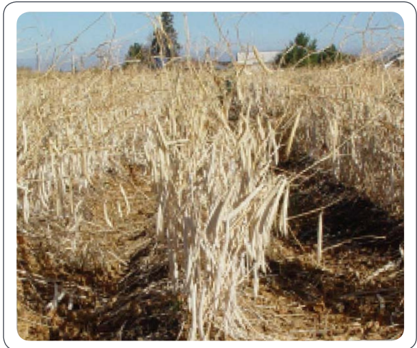
NA 99081 VS. NORSTAR

Assuming a 340 lbs./AC yield increase over Norstar, this variety can potentially increase your profit $54/AC on $16cwt. beans, minus the difference in seed cost/AC. This can calculate out to an approximate $7,500 increased profit over Norstar on one quarter section field.