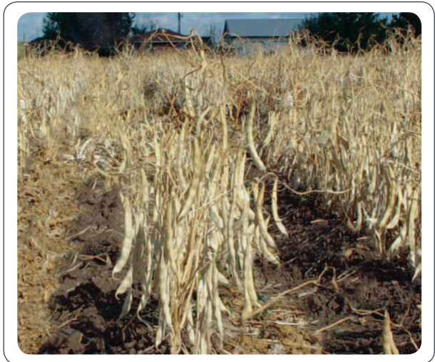
99217 VS. MAVERICK*

Assuming a 210 lb./Ac yield increase over Maverick this variety can potentially increase your profit $63.00/AC on $30.00/cwt. beans, minus the difference in seed cost/AC. This can calculate out to an approximate $9,504 increased profit over Maverick on a one quarter section field.