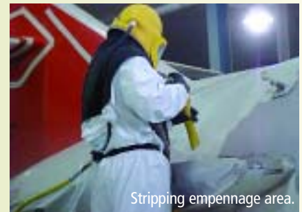
Stripping empennage area.