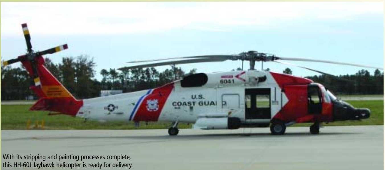
With its stripping and painting processes complete, this HH-60J Jayhawk helicopter is ready for delivery.