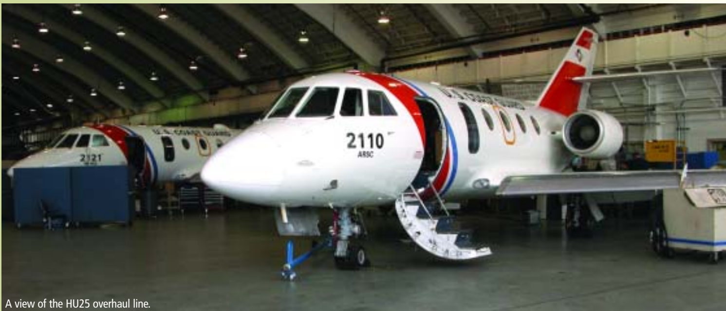
A view of the HU25 overhaul line.