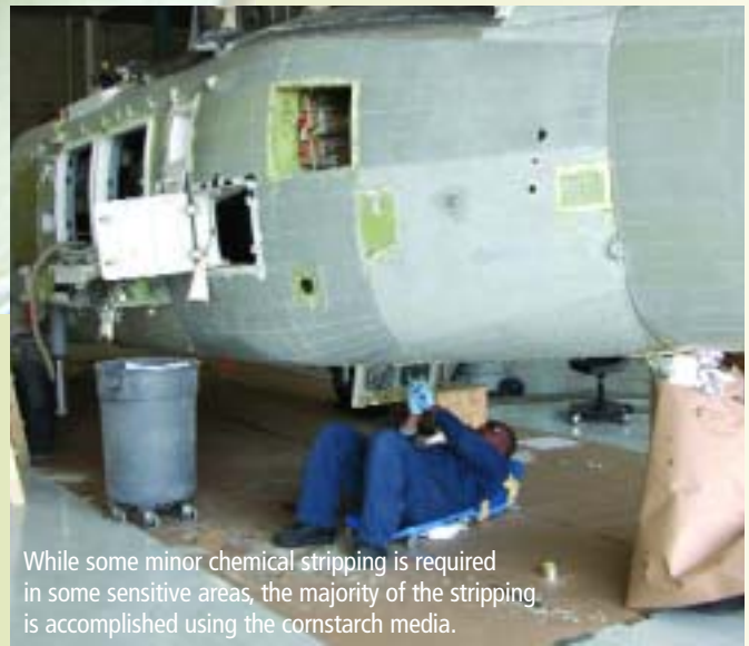
While some minor chemical stripping is required in some sensitive areas, the majority of the stripping is accomplished using the cornstarch media.